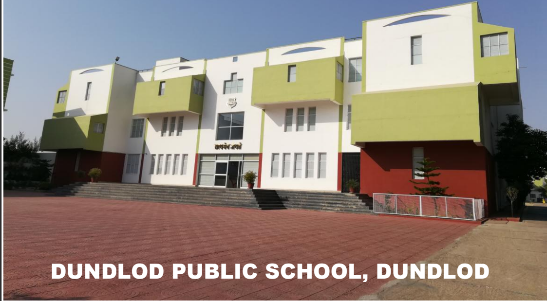
DUNDLOD PUBLIC SCHOOL, DUNDLOD

"Where Good Education Leads Goods Human Being Follows"